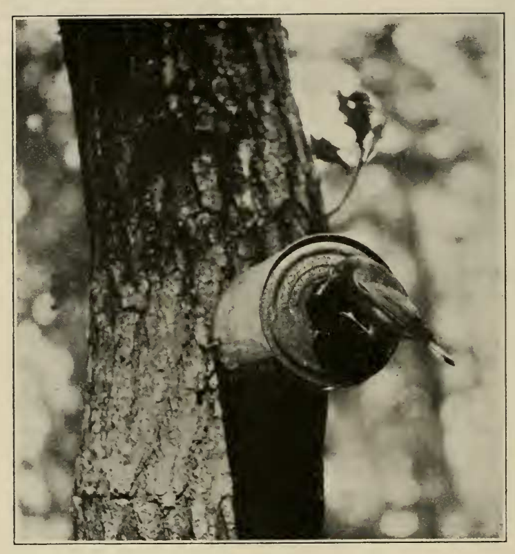
PROTHONOTARY WARBLER ABOUT TO FEED YOUNG